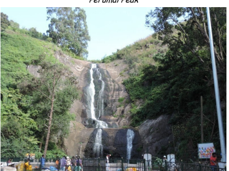
Silver Cascade Falls